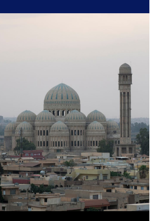
"For God has not given us a spirit of fear, but of power and of love and of a sound mind." 2 Timothy 1:7 (NKJV)

Mosul, the capital of Ninawa Governorate, is Iraq's second-largest city. The population has traditionally consisted of Kurds and a significant minority of Christian Arabs. After much ethnic conflict, the city fell to the Islamic State of Iraq and Levant (ISIL) in June 2014. In 2017, Iraqi and Kurdish forces finally pushed out the Sunni insurgents. Since then, efforts have been made to restore the war-torn region.